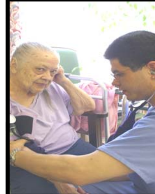
Code of Ethics

Honor your Caregivers with a Facility Sponsored Membership